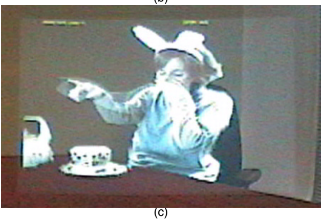
Figure 2. A Mad Tea Party. The user looks across the table at (a) the Mad Hatter to their left, (b) the Dormouse across from them, and (c) the March Hare to their right. The Mad Hatter has just been splashed with tea by the user, causing the March Hare to laugh at the Hatter. The Dormouse is asleep, but will soon wake up from the noise.

right time to experience the narrative, and that they understand how they can interact with the story.